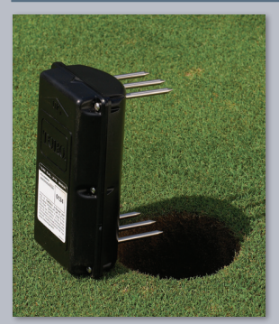
Wireless Sensor Measures Moisture, Temperature and Salinity Levels